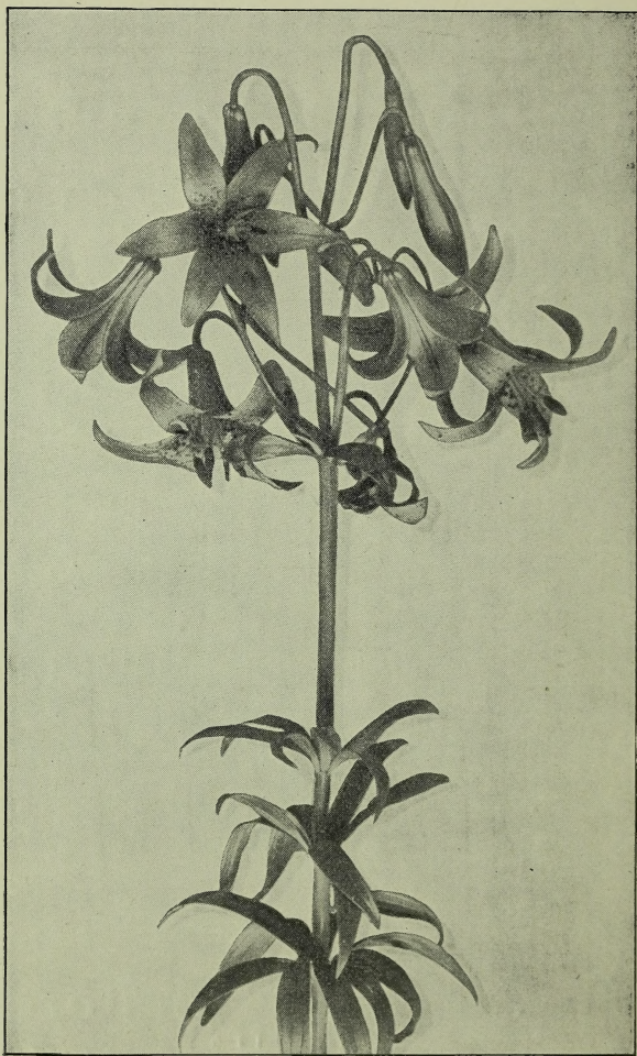
Wild Meadow Lily